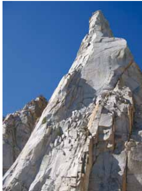
Third Pillar of Dana from the base – perfect alpine granite.

The Tuolumne Mountain Shop (209-372-8436) located at the Tuolumne gas station offers a small selection of climbing equipment. For a more extensive selection of gear, you will need to drive 50 miles to Mammoth for Mammoth Mountaineering Supply (888-395-3951) www.mammothgear.com , 90 miles to Bishop for Wilson's Eastside Sports (760-873-7520) www.eastsidesports.com , or 60 miles back to Yosemite Valley for the Yosemite Mountain Shop (209-372-8396) www.yosemitgifts.com/wetoyomosh.html . You can get climbing instruction and